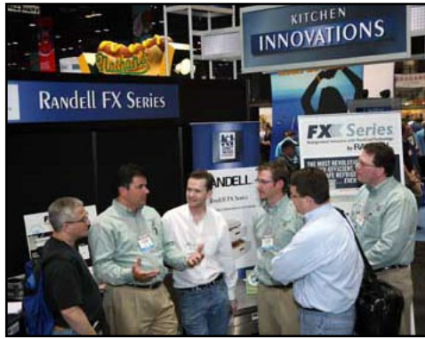
Unified Brands personnel reviews FX Series benefits with national chain Cheddars and equipment distributor SS Kemp and Company.

Unified Brands is extremely proud of being selected to display the Randell FX Series in the Kitchen Innovations Pavilion at this years NRA show. The Kitchen Innovations award recognizes the industry's most innovative products and the FX booth was the center of attention. The honor was awarded to the FX Series by a panel of judges of some of the most influential leaders in the foodservice equipment industry and gave us the opportunity to promote our new product to the most influential buyers and specifiers. Many end users came back 2-3 times to follow-up on the innovative solutions FX can provide.